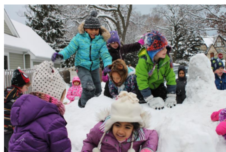
Kindergartners frolic in the snow.

As alumni, past parents, and grandparents of Baker Demonstration School, you are uniquely aware of the exceptional education