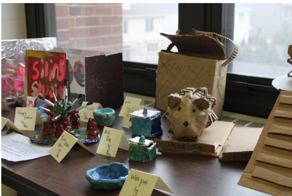
More examples of the wonderful creations done by our students.