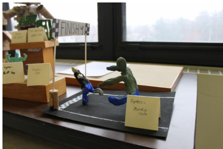
Studio Arts creations from this year's Arts Core Night.

Click here to be taken to the Baker Benefit website!