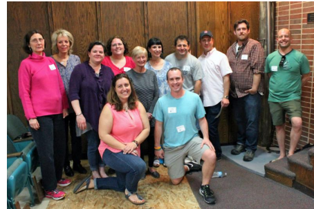
Alumni at the Time Capsule Opening in April.

It's time to break-out the name tags! November 10-12, 2016 is our first Alumni Weekend at Baker. There is something for everyone!