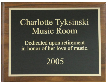
The plaque dedicating our music room to Charlotte, who loved to sing!