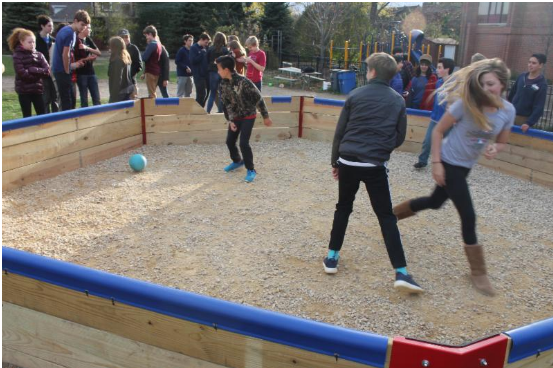
Ga-Ga Pit fun!