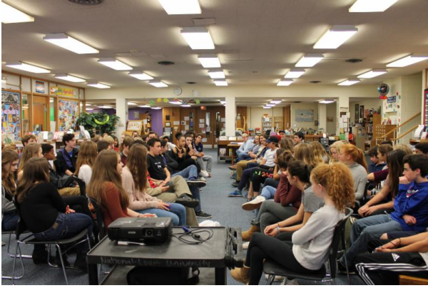
Left, alumni, right, current 8th graders

reconnected with each other, current students, and the school as a whole. They had a packed afternoon of mingling, sharing experiences, and, of course, a little time to play.