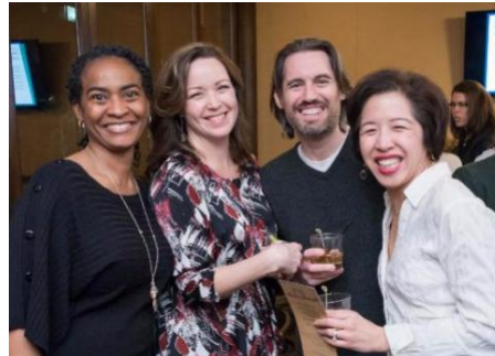
Community members enjoying last year's Benefit