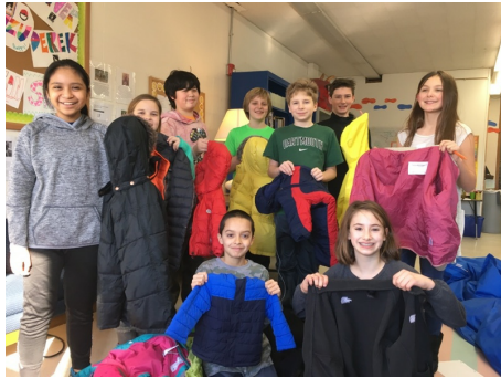
Students proudly display some of the donated coats.